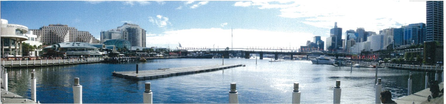
Darling Harbour Map & Hotel locations